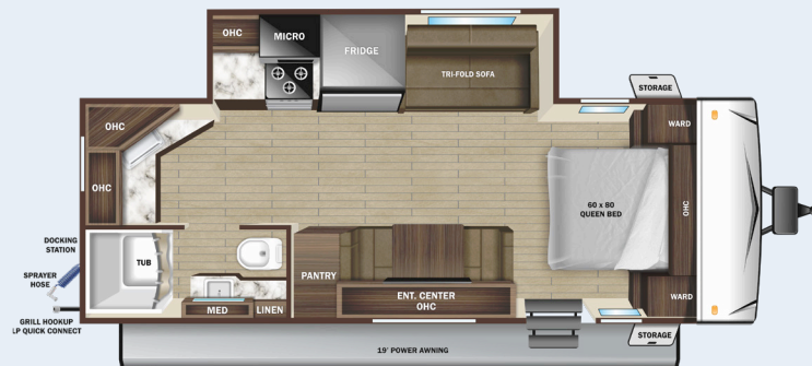
225CK A OPTIONS