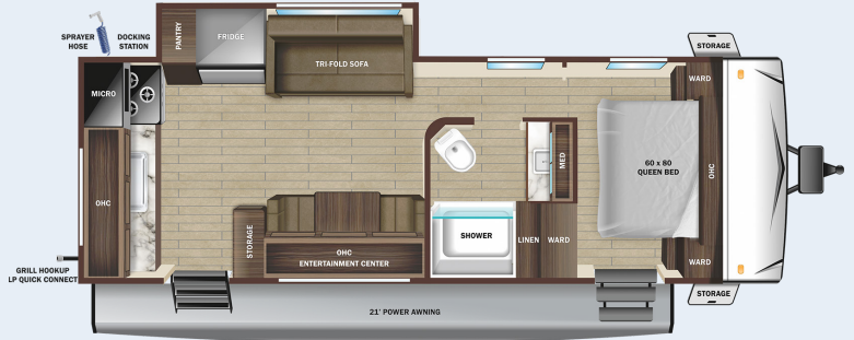
233ML A, B & C OPTIONS