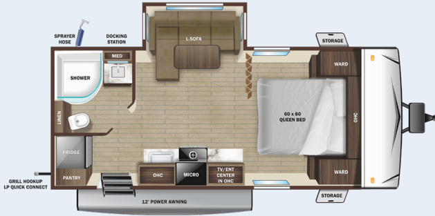
212FB A OPTION