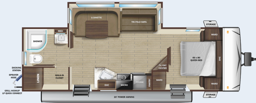
252RB A, B & C OPTIONS