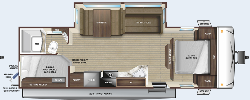
261BH A, B & C OPTIONS