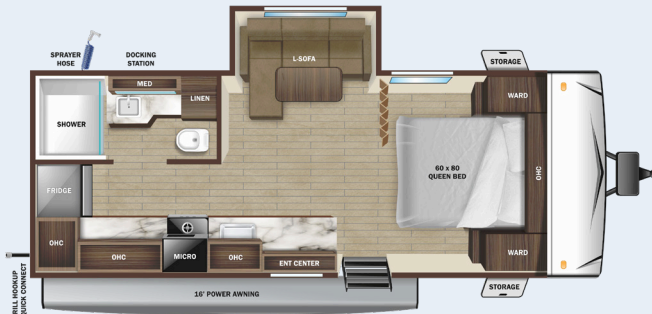
189RG A OPTION