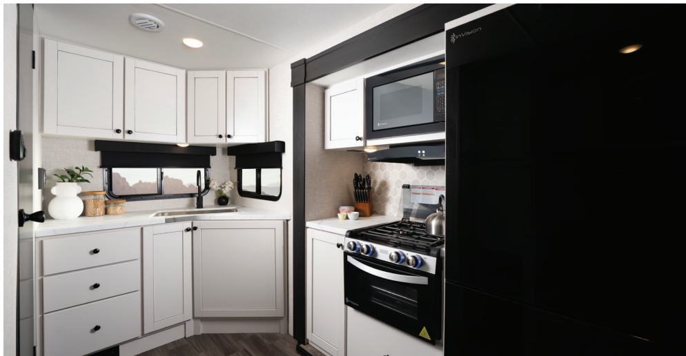
2025 Range Lite 225CK