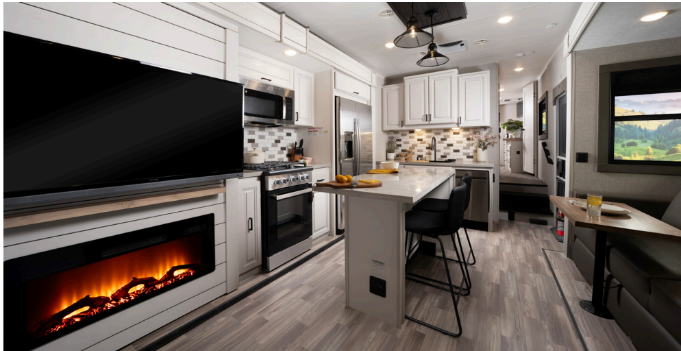
2025 Open Range 3X 390TBS FW