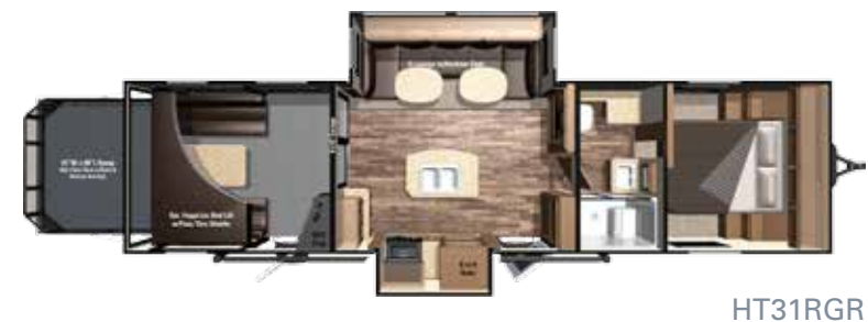
Ext. Length: 37' Ext. Height: 138" UVW (lbs.): 9,585 Sleeps: 8