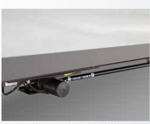
Power Stabilizer Jacks (Optional)