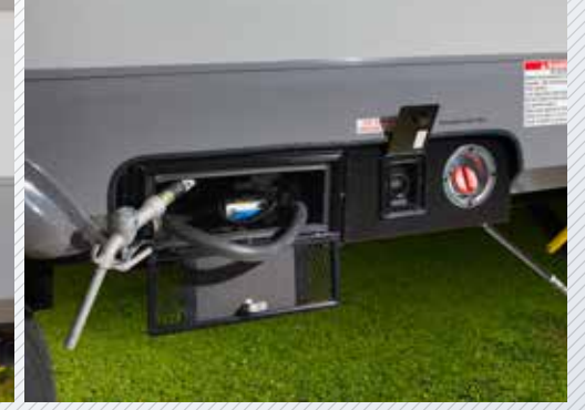
30 Gal. Fuel Cell