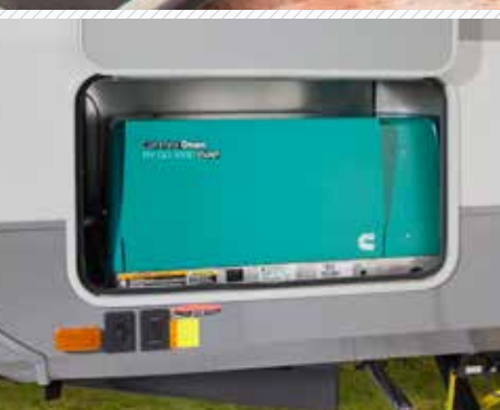
Onan 5500 Gas Generator (Optional)