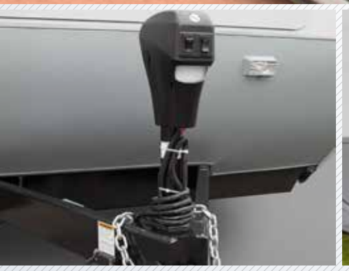
Power Tongue Jack