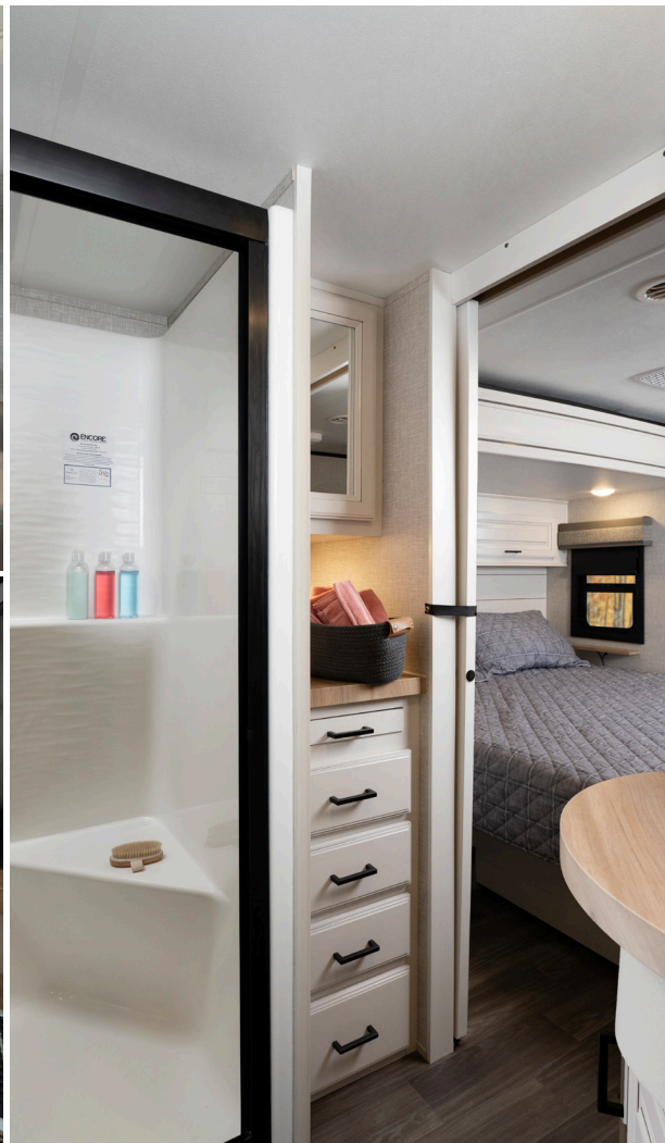
2024 Open Range 371MBH