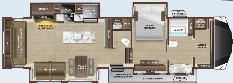
379FBS OPTIONS B & C