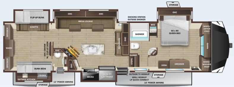
395BHS OPTIONS A & C