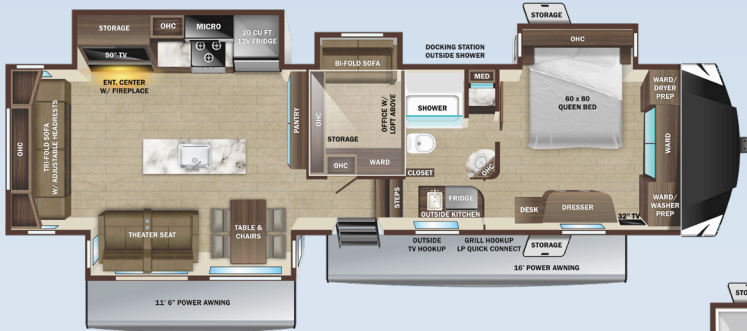
371MBH OPTIONS B & C