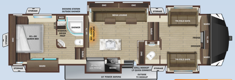
376FBH OPTION A