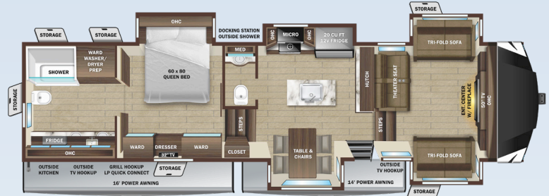
373RBS OPTION C