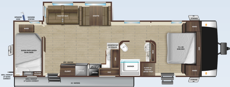
296BHS OPTIONS B, C, & D