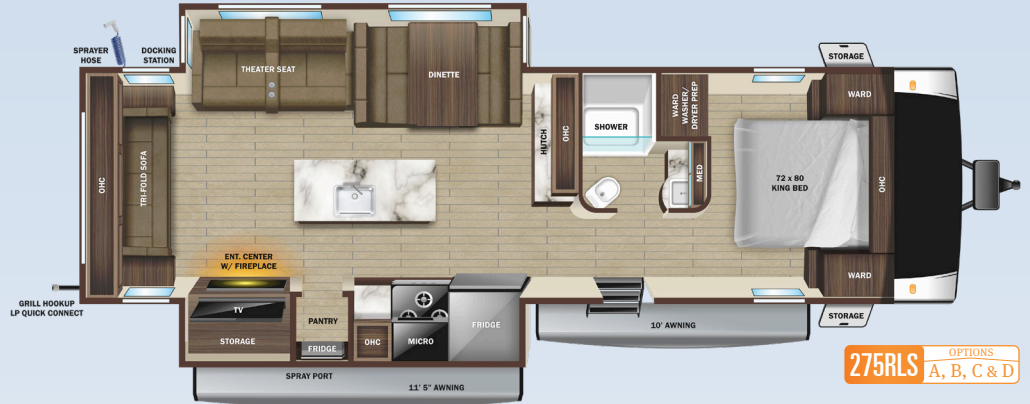
275RLS OPTIONS A, B, C & D