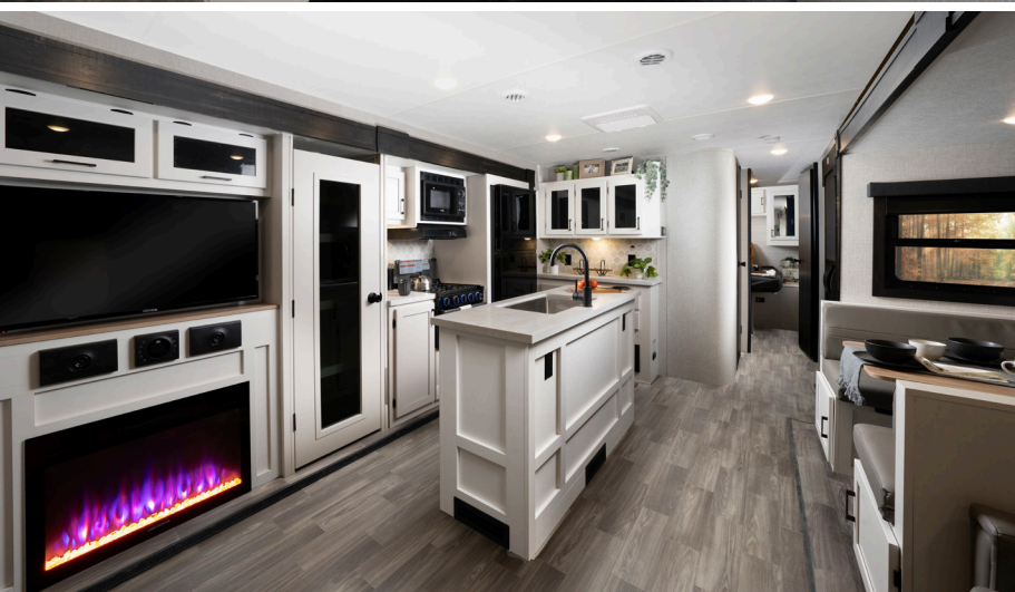
2024 Light 290RLS