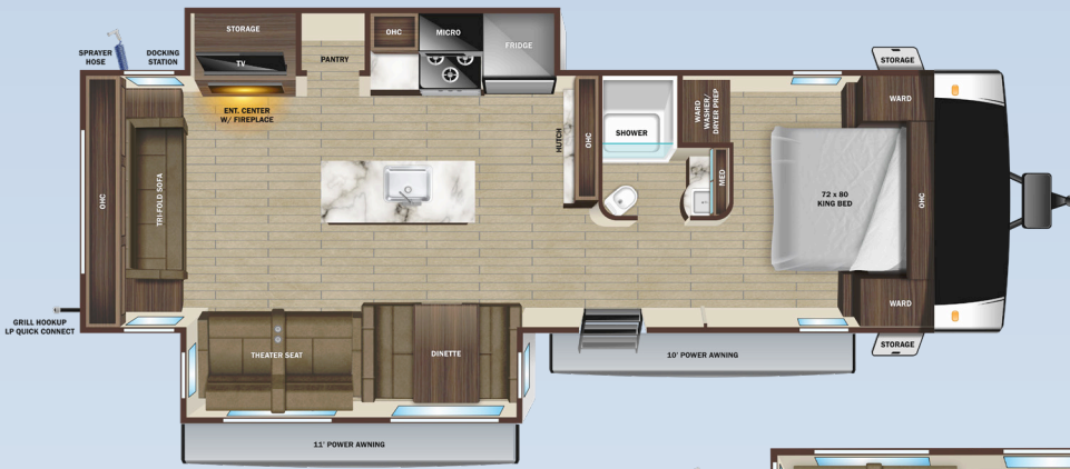
290RLS OPTIONS A, C & D