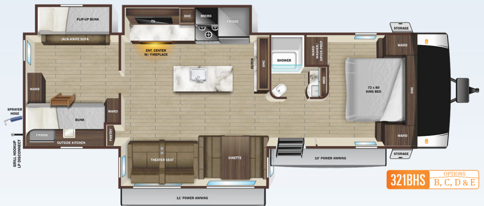
321BHS OPTIONS B, C, D & E